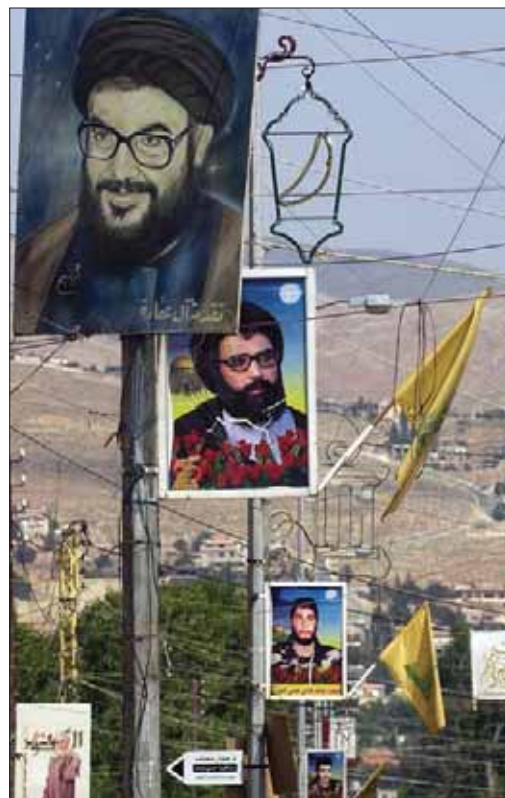
High Profiles. Posters of current Hezbollah leader Sheik Hassan Nasrallah and the previous leader Abbas Al-Musawi, left, are displayed on electrical poles in Baalbek, in eastern Lebanon.

The Palestinian issue is not an abstract one for Lebanon, which is home to 300,000 Palestinian refugees whose families originally came here after the 1948 Arab-Israeli war. Many of them live, without the rights to vote or own property, in the cramped and