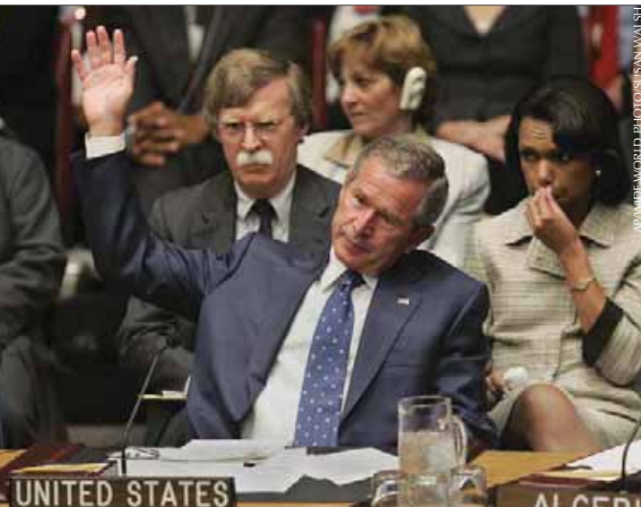
Global Agreement? President George Bush, along with more than 160 other world leaders, attended the UN Summit in September to discuss the principles of a more secure future.

Such varied threats present tough challenges to the political leaders of the world community and to the United Nations, the international body through which they cooperate on these problems. Indeed, world leaders' best prospects for tackling such challenges is by working together, and the purpose of the 2005 World Summit was to equip them with a stronger United Nations for that very task.