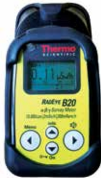
Dose rate meter