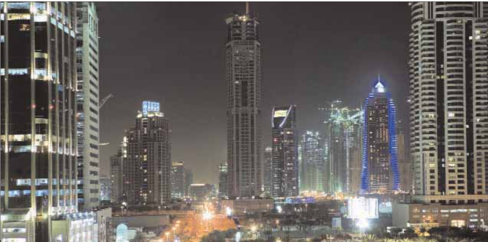
Dubai, UAE, March 2006.

To learn more about this photography project and the radio documentary special “24/7: The Rise and Influence of Arab Media,” visit the special Web feature from the Stanley Foundation: “Security in an Era of Open Arab Media,” www.stanleyfoundation.org/initiatives/oam , containing a wealth of resources including original articles, expert interviews, in-depth policy analysis, photojournalism, and material from the public radio documentary.