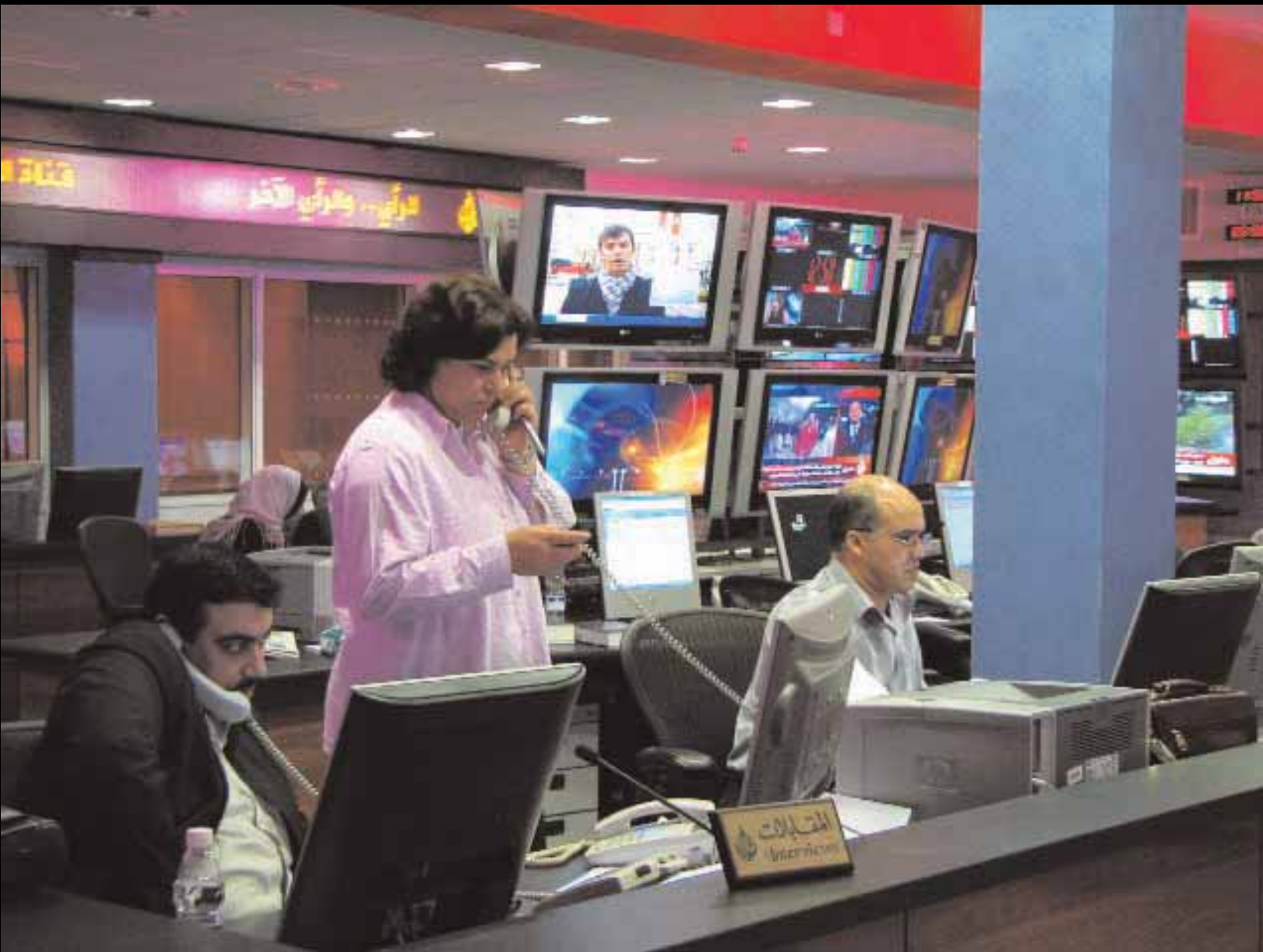
Newsroom at Al Jazeera television station. Doha, Qatar, December 2005.