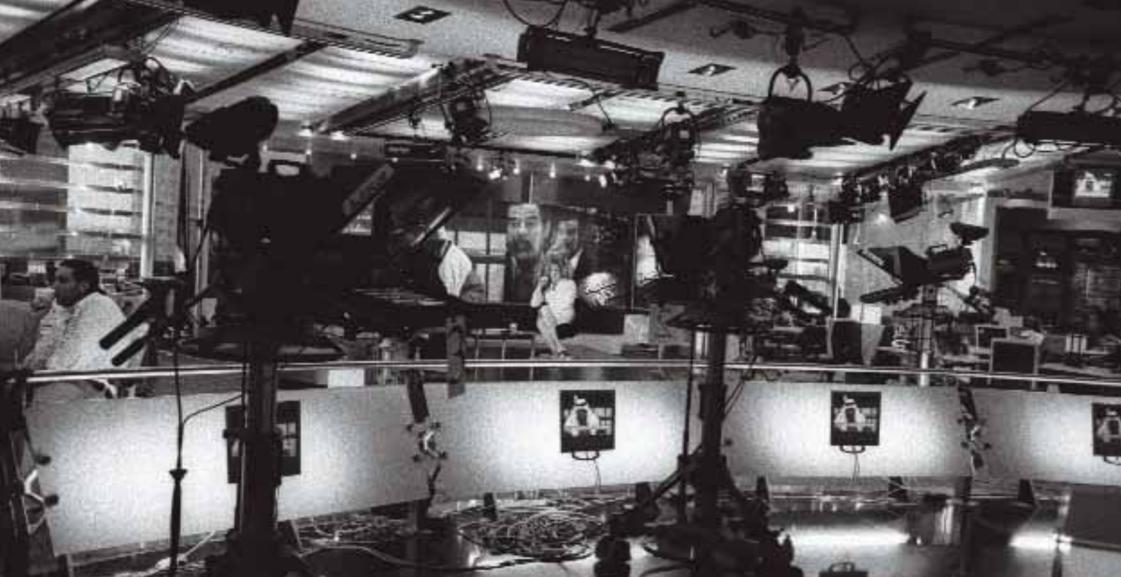
Studio and newsroom at Al Arabiya television station. Dubai, UAE, March 2006.