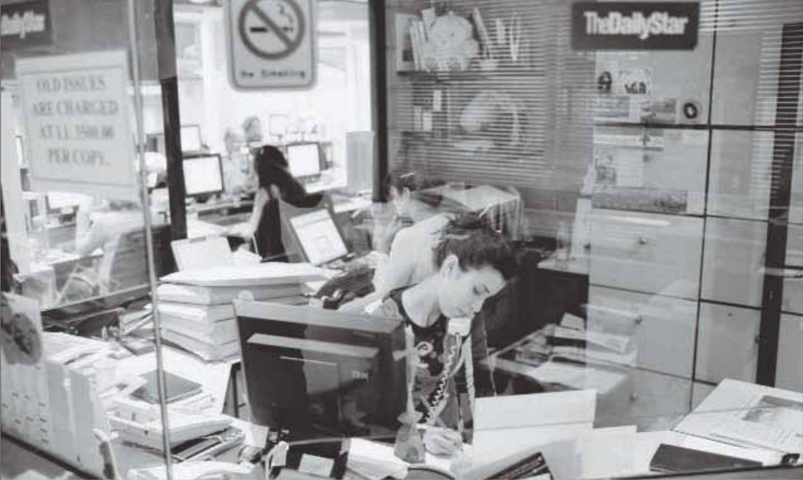
The Daily Star newspaper office, Beirut, Lebanon, March 2006.

“It doesn’t matter if it’s reflecting the street or not. The norms and standards of responsible journalism, for example, call to have both sides of the story presented. But I went over scripts and transcripts of AJ coverage, which gave currency to lies and myths. Only the Palestinian sources were quoted; no Israelis were interviewed for those stories whatsoever. And it has been done repeatedly. I think anyone who cares about coexistence between Christians, Muslims, and Jews should denounce Al Jazeera for consistently giving voice to the most radical, most hateful representatives of Jihadi Islam.”