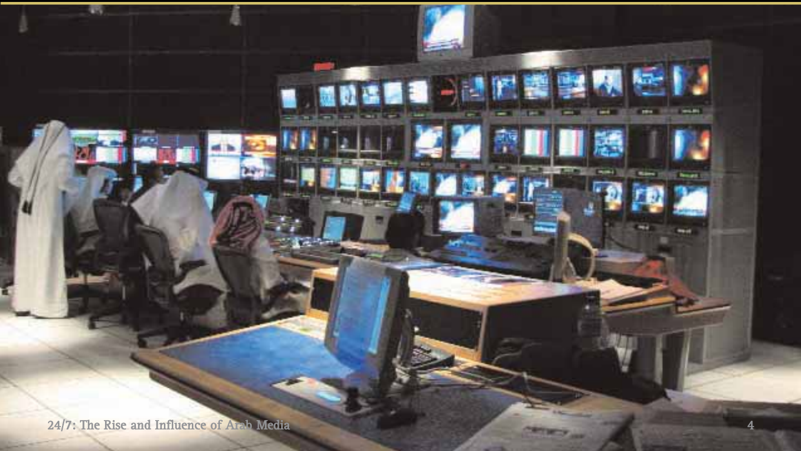
Control room at Al Jazeera station, Doha, Qatar, December 2005.

Most Americans have probably heard of Al Jazeera. Yet most of us know very little about it or the station’s many news competitors in the Arab world. Al Jazeera is headquartered in Doha, Qatar—a tiny country on the shores of the strategically vital Persian Gulf. The Gulf is also home to Al Jazeera’s main competition, Al Arabiya, a 24-hour news channel broadcasting from the city of Dubai in the United Arab Emirates.