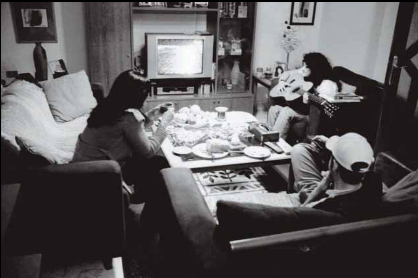
Single mother watches television with her children. Beirut, Lebanon, March 2006.