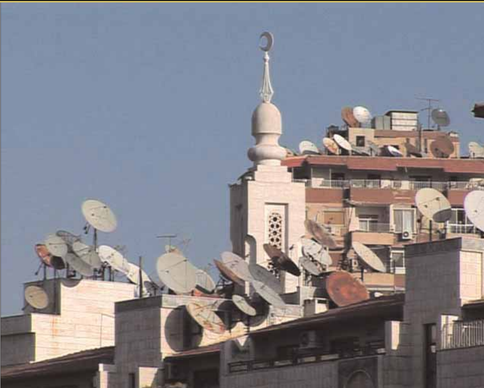
Satellite Dishes in Damascus, Syria, December 2005. Feature Story News