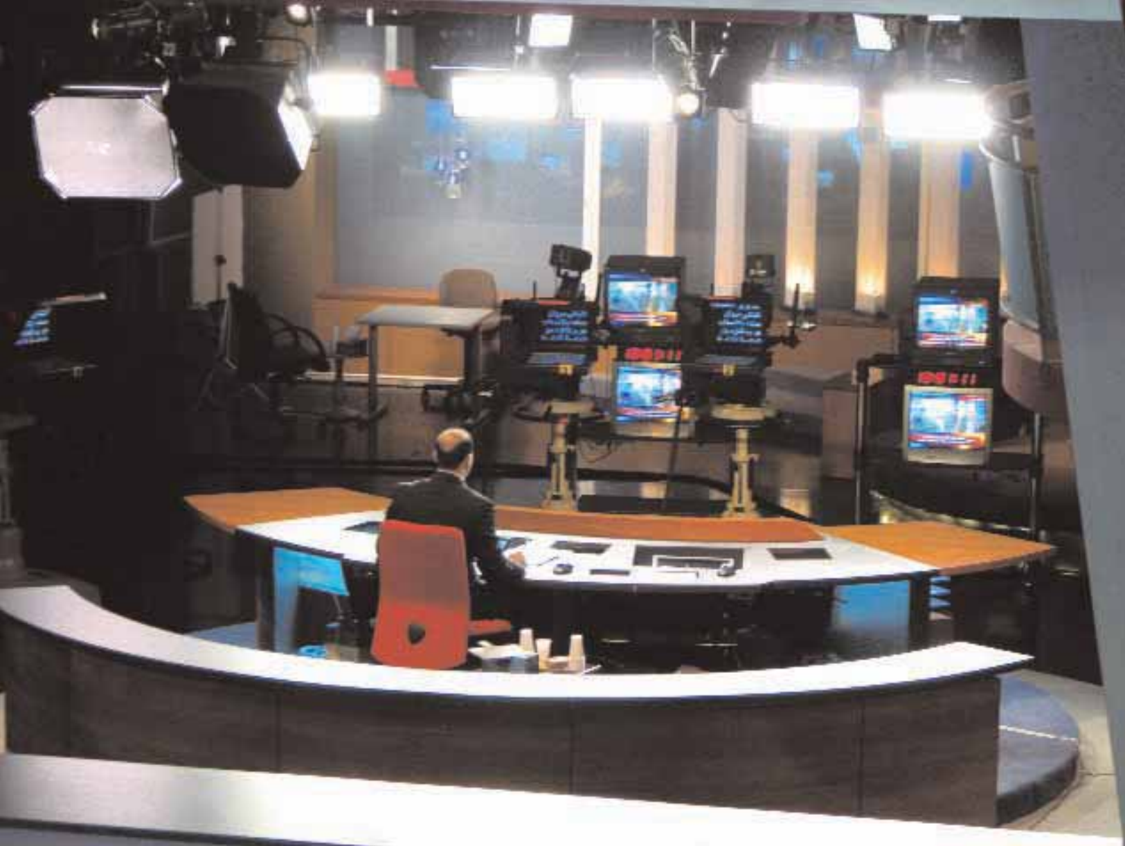
Anchor desk at Al Jazeera television station. Doha, Qatar, December 2005.

In the documentary “24/7: the Rise and Influence of Arab Media,” we brought you some of the complexity being handed to us as Arabic language television catches fire. Some see this rich and unruly marketplace of ideas pumped onto TV screens as ultimately healthy for the region. Others will still choke on the fact that a portion of what gets onto those screens can breed intolerance and violence.