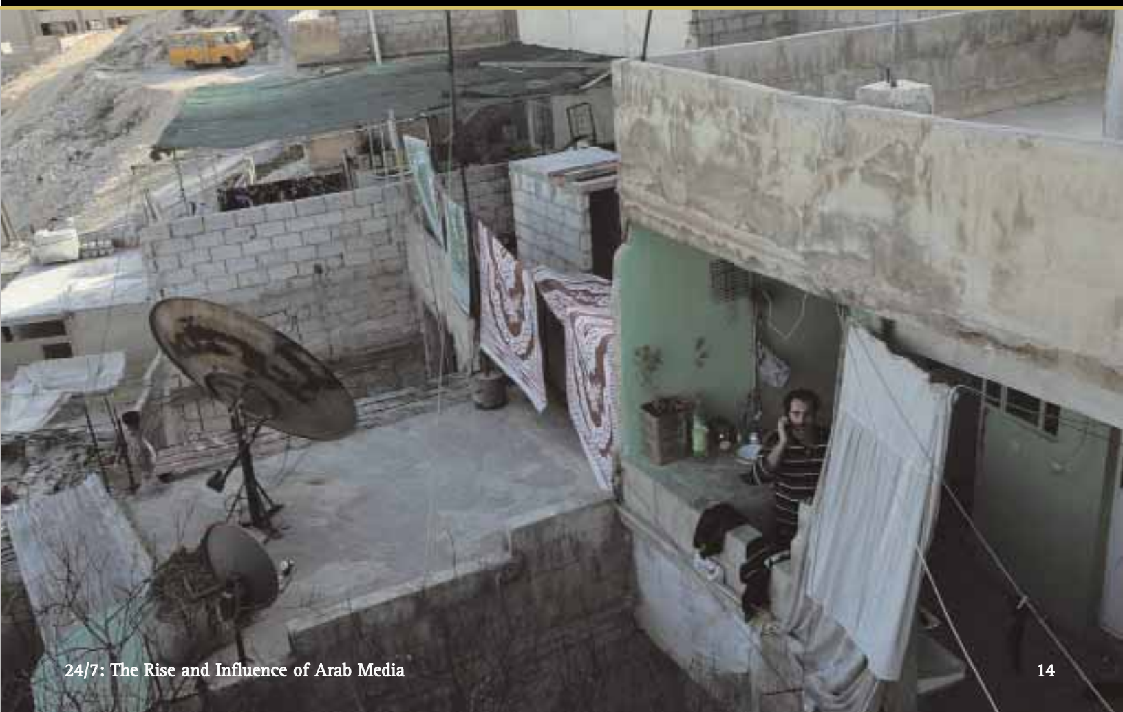
Man making a call from the balcony of his apartment in the Dummar area east of Damascus, Syria, March 2006.