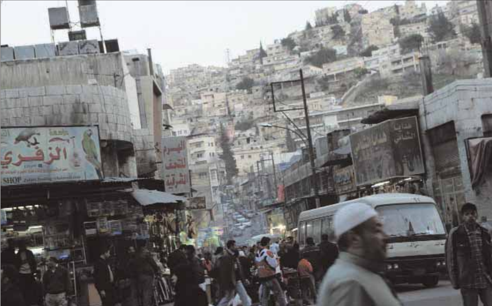
Downtown Amman, Jordan, February 2006.